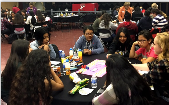
Soroptimist Artesia-Cerritos International Dream It, Be It Conference at Artesia HS, November 17, 2016